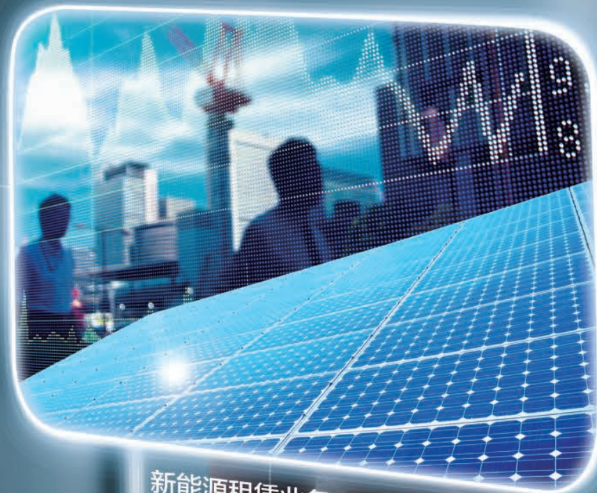
新能源租赁业务 NEW ENERGY LEASING