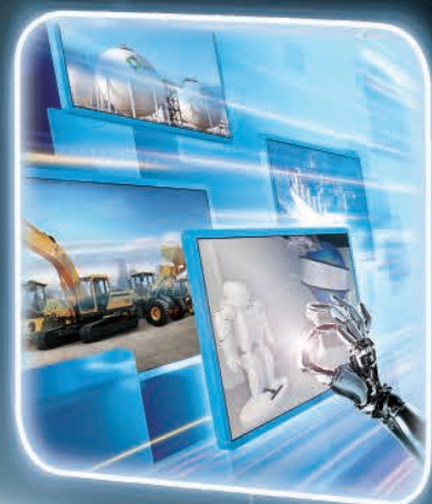
机电装备租赁业务 ELECTROMECHANICAL EQUIPMENT LEASING