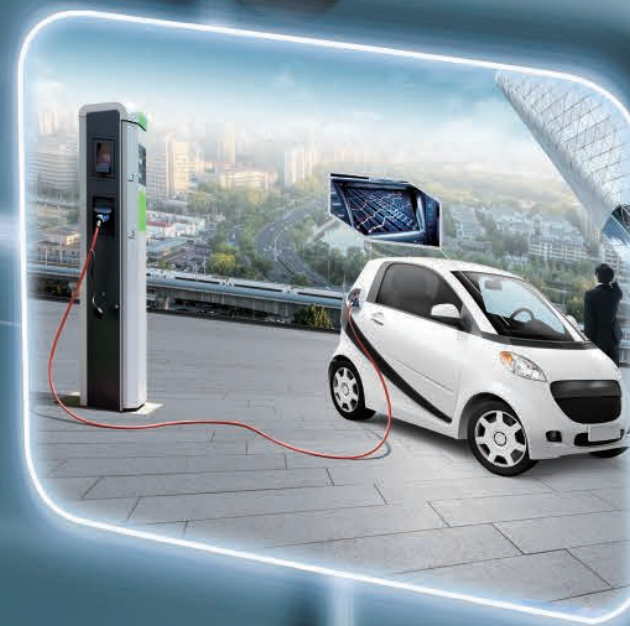
智慧交通租赁业务 SMART COMMUTE LEASING