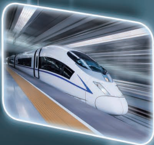
综合租赁业务 COMPREHENSIVE LEASING